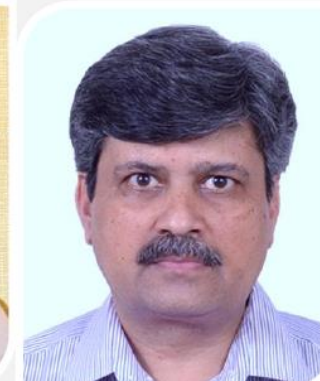
Farhan Kidwai Golf Tournament Uniproducts