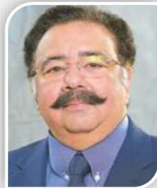
Rattan Kapur Mark Exhaust