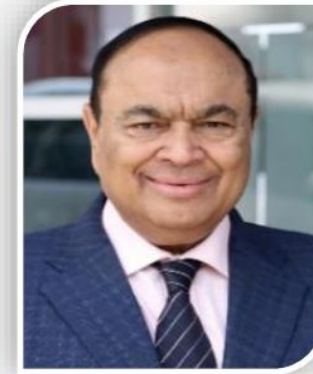
N.K. Minda Uno Minda